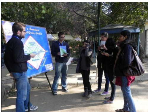
Picture 11: Students take the 'World's Smallest Political Quiz', Freedom Caravan 2012