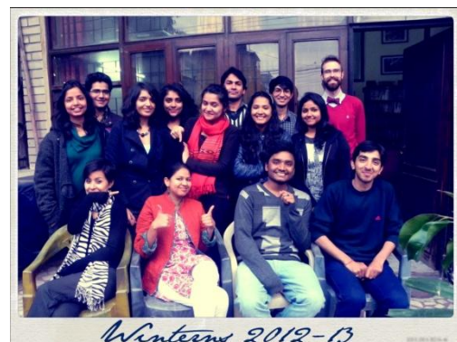
Picture 10: Our winterns, 2012-2013