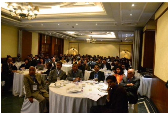
Picture 6: School owners, association heads and education service providers at the School Leaders Summit, December 2012

NISA held four national level meets in the last calendar year. The workshops in June and September saw NISA members come together to discuss ideas and strategies around advocacy for budget private schools and school improvement.