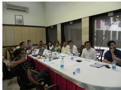
Picture 5: Participants at the Policy Forum on Alternative Service Delivery Mechanisms, August 2012